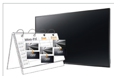
Built-in scheduler automatically activates and deactivates the PM-43 with designated input signal according to programmed schedules.