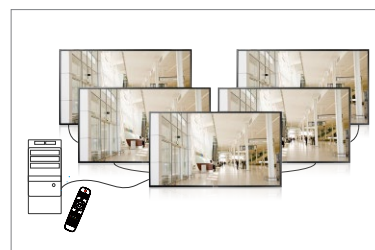
RS-232/ RJ45/IR for remote control