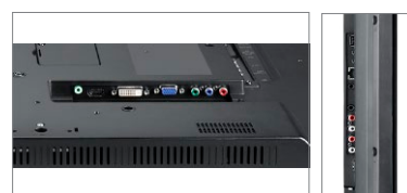
Versatile connectivity: VGA, DVI, HDMI, Composite, Component